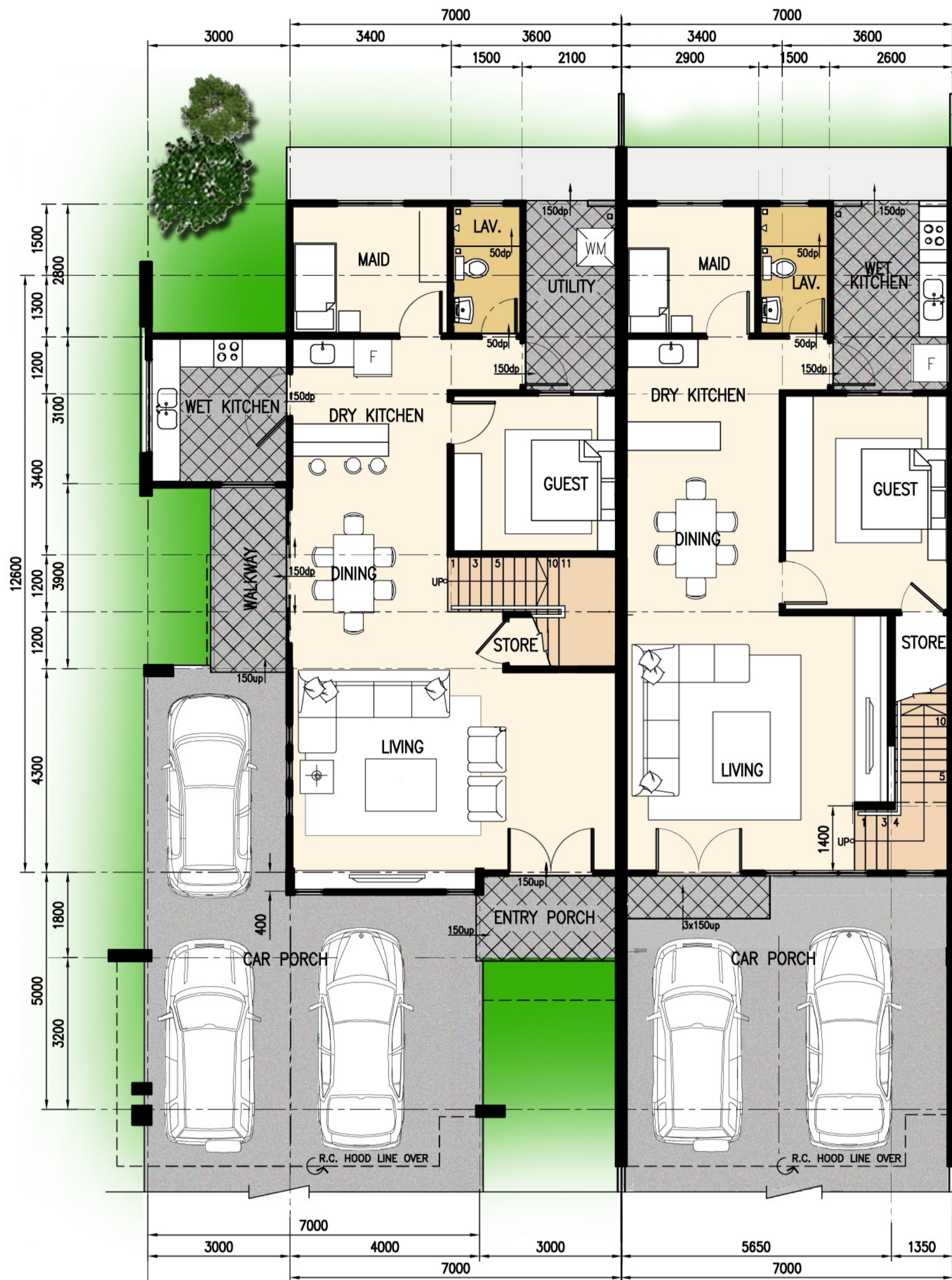
CORNER INTERMEDIATE GROUND FLOOR