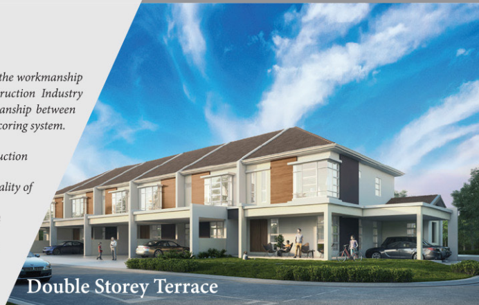
Double Storey Terrace

Call our sales hotline +6013 833 7788 for more information on this great new project.