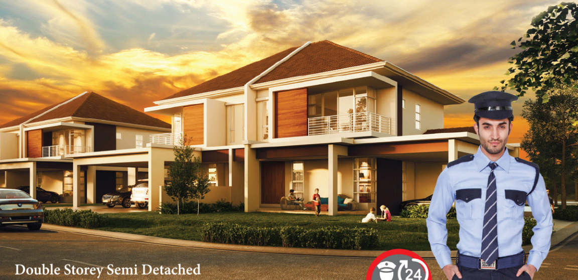
Double Storey Semi Detached

[ A new home that promises the quality and style of pretigious in a peaceful location with all the benefits of lifestyle! ]