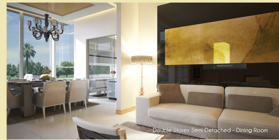
Double Storey Semi Detached - Dining Room