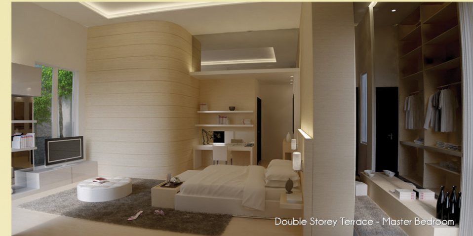
Double Storey Terrace - Master Bedroom