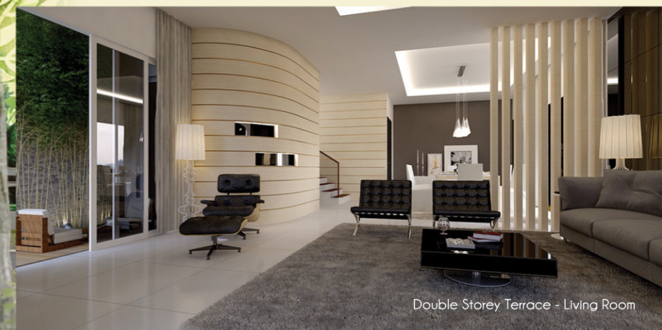
Double Storey Terrace - Living Room