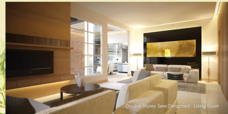
Double Storey Semi Detached - Living Room