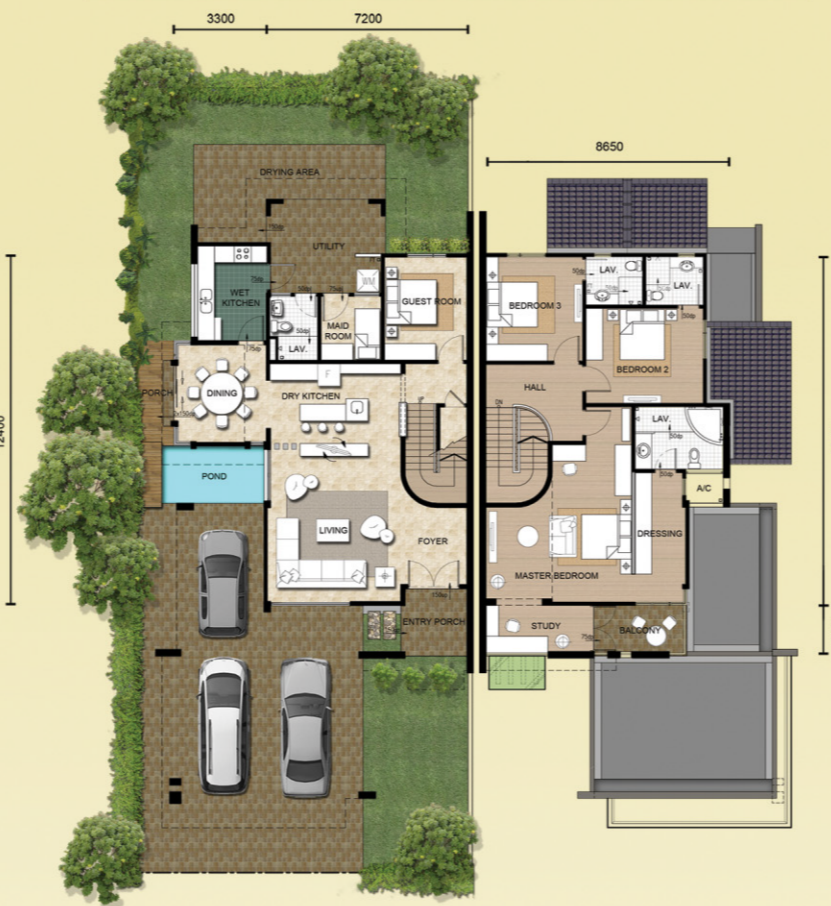
Ground Floor First Floor